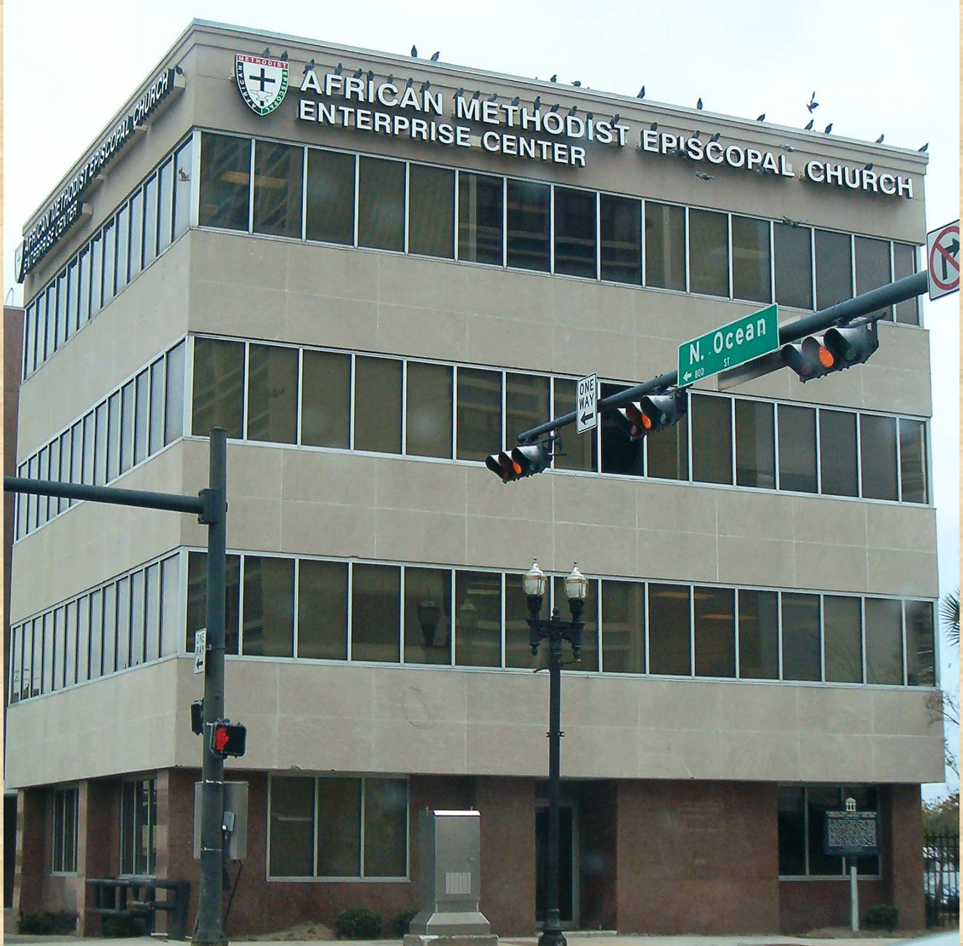
"THE AMEC ENTERPRISE CENTER of the 11th EPISCOPAL DISTRICT with DOVES & ORBS " (AJSQ) ~ JACKSONVILLE, FL

Magazine Content updates are continuous ~ Please send your events & AME flyers for publication!