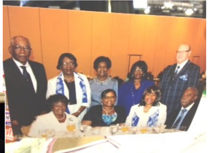
Eleventh Episcopal District Laity Gather For a Photo

Happy Birthday Connectional Lay Organization!